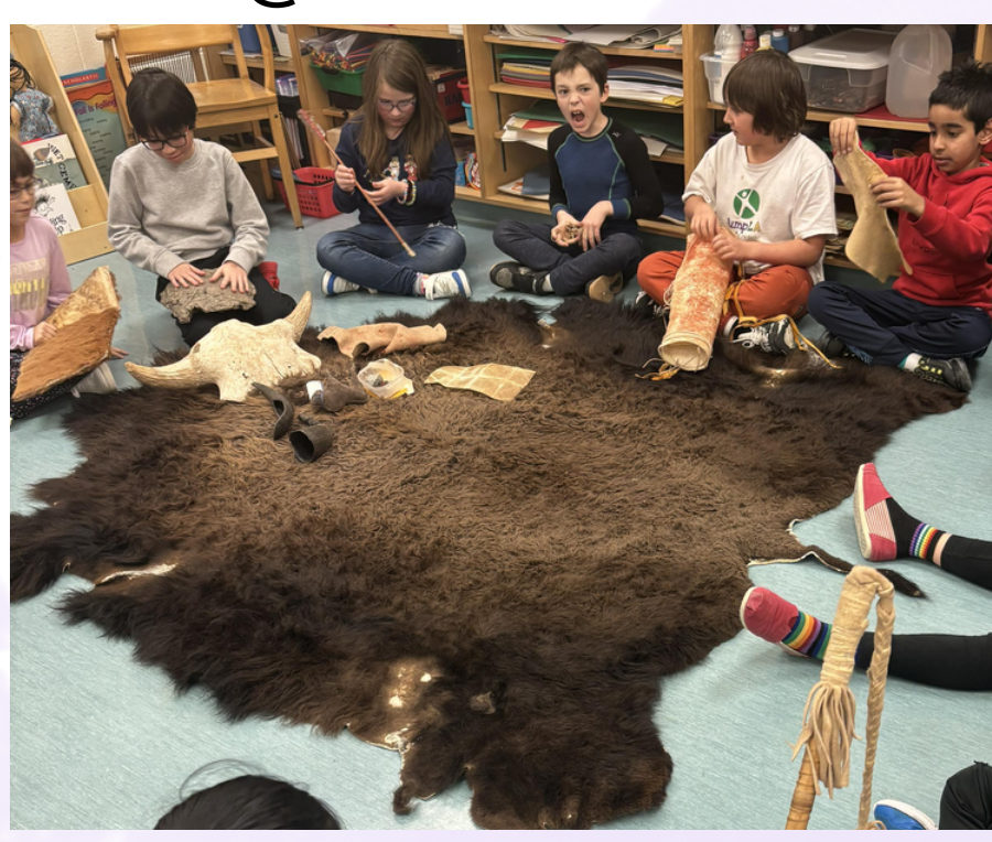
Buffalo Kit @ Fleetwood