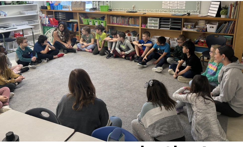
We got to attend a Sharing Circle @ Nicholas Sheran