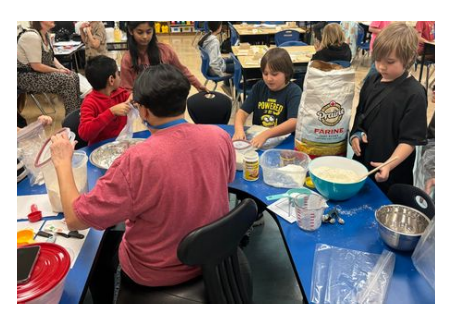
Made Bannock @ Fleetwood