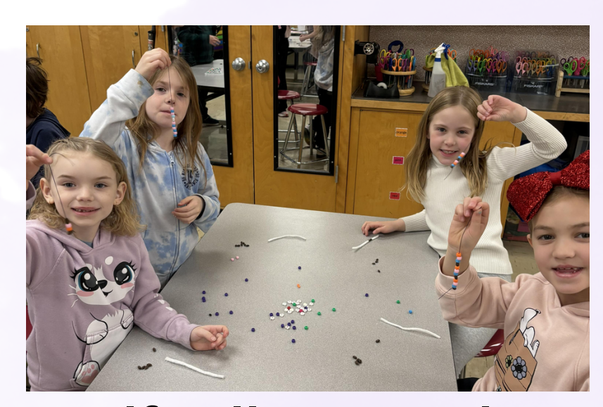
Wolf Willow Bracelets @ Agnes