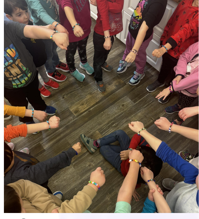
Wolf Willow Bracelets @ ICES