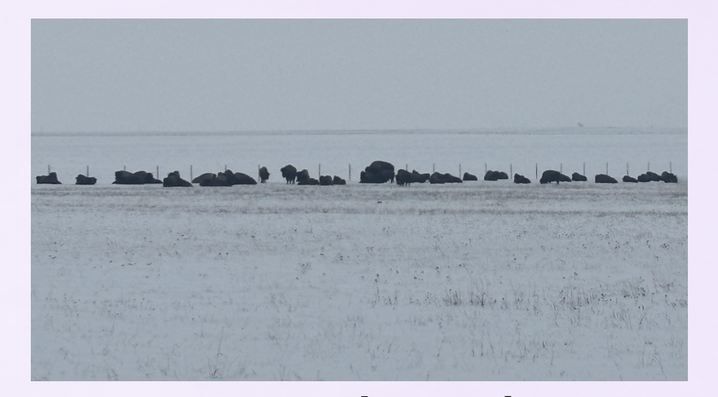
Learning about the Buffalo on the Blood Reserve