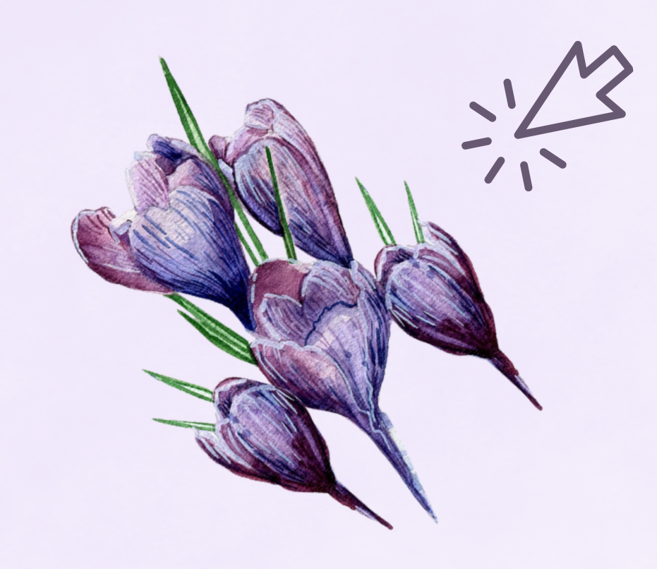
The Prairie Crocus is the first flower we'll see in the coulees! Click to read a Blackfoot legend about the Crocus.