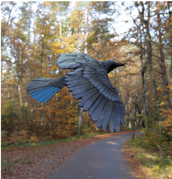
Created by Brooke Potiuk

One of the largest growth factors of the digital media program is the desire to pursue digital media courses beyond high school. With multiple students enrolled in computer science, and for the first time in many years we have students heading to the top digital media programs in the country - if not the world. BCHS currently has four students going to Vancouver Film School in the next year and one going to the top game design school in the world known as Think Tank Training Center.