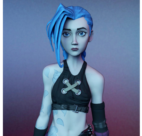
Created by Brooke Potiuk

One of the largest growth factors of the digital media program is the desire to pursue digital media courses beyond high school. With multiple students enrolled in computer science, and for the first time in many years we have students heading to the top digital media programs in the country - if not the world. BCHS currently has four students going to Vancouver Film School in the next year and one going to the top game design school in the world known as Think Tank Training Center.