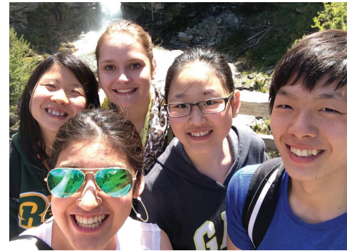
Students from three continents