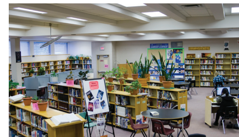
Library at Lethbridge Collegiate Institute