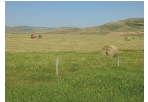
Area surrounding Lethbridge