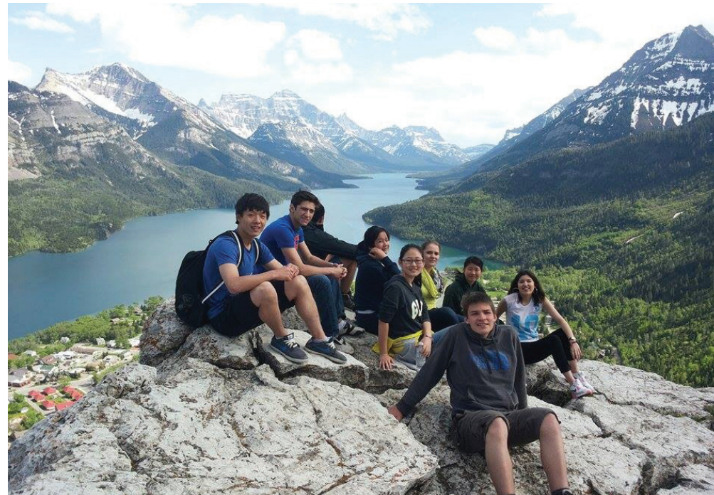
International Student Excursion to Waterton International Peace Park