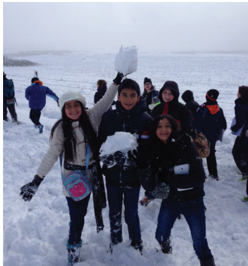
Students see snow for the first time!