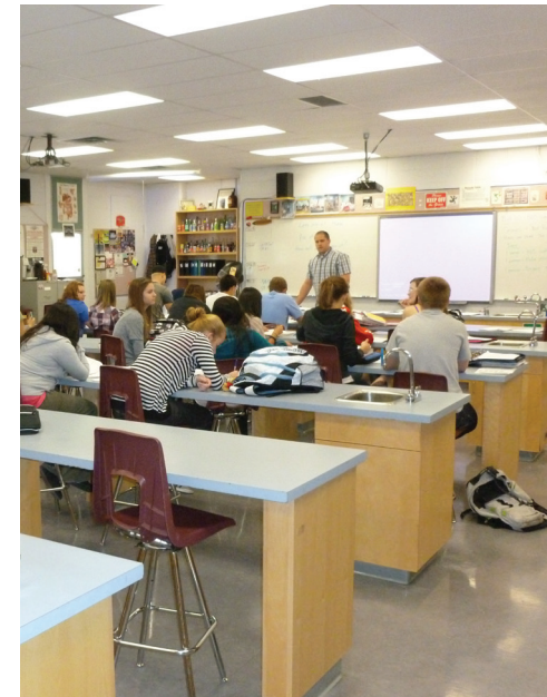
Science lab at Winston Churchill High School