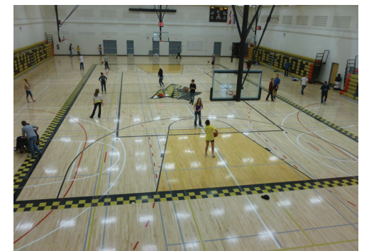
Gymnasium at Chinook High School